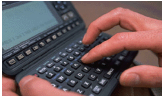
Help with financial management, education and job skills etc. ....

The Casey Life Skills Guidebook Curriculum, the other focus of the Jabez Program, represents a competency based learning strategy. The guidebook provides an indication of life skill level and readiness for living on one's own and independently with others. The guidebook and learning resources, while not exhaustive, help with goal setting, action planning, instruction, learning and application. In using the guidebook, it is critically important to keep the central role of the person getting ready to live on his/her own in mind. Jabez staff will be supporting the guidebook activities on a daily basis both in our facility and in the community.